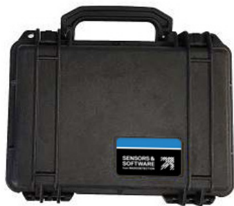
100-55-0023 Spare Battery