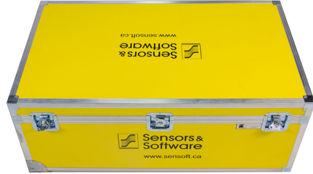
100-60-0061 LMX150™ FINDAR® Series ATA Shipping Case (with DVL Bag)