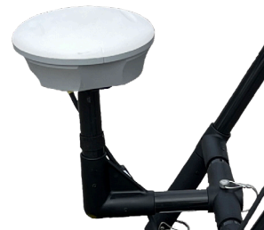
100-54-0150 AG-200 GPS Kit for LMX150™ FINDAR®