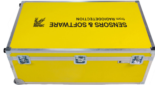
100-60-0061 LMX® Series ATA Shipping Case (includes 100-60-0059 DVL Bag)