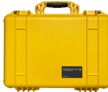
100-60-0066 Deluxe Display Unit Carrying Case