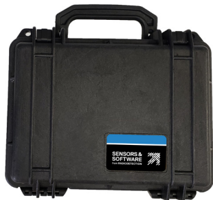
100-55-0023 Spare Battery