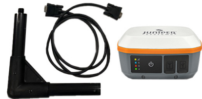
100-54-0160 100-54-0160-RTK 100-22-0124 LMX-SG Package LMX-SG with RTK Package Geode RTK Upgrade