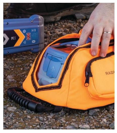
Large front flap provides access to Transmitter sockets.