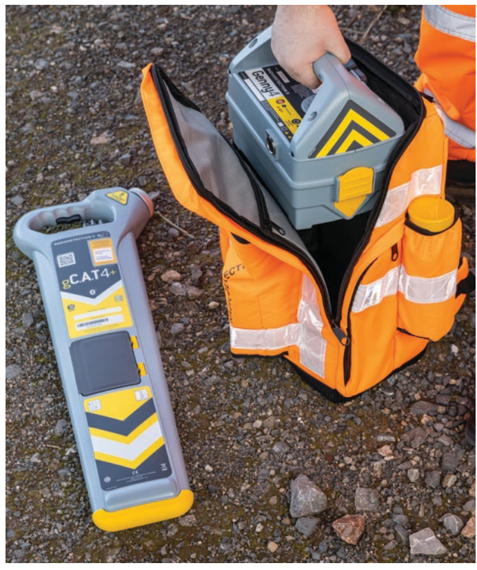
High visibility reflective tape that meets the requirements of EN ISO 20471.