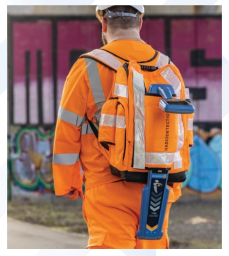
External sleeve with Velcro release to hold a range of Radiodetection equipment, easily and securely.