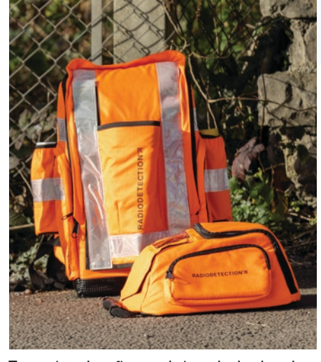
Transmitter bag fits neatly into the backpack, with space for additional accessories.