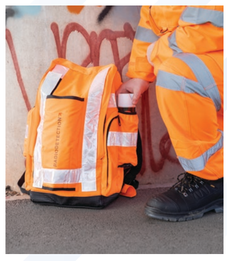
Storage options designed for spray cans and tools.